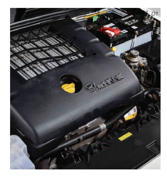
01 - Mahindra's legendary 2.21 mHawk turbo-diesel engine with new 5-speed manual transmission. 02 - Projector headlamps with distinctive LED eyebrow. 03 - Distinctive 17" Alloy wheels